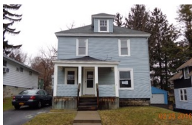
126 Charmouth Dr, Syracuse