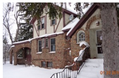
6022 S Salina St, Syracuse