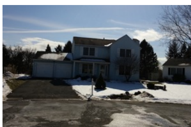
219 S Dolores Terr, N Syracuse