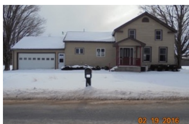
5160 Brown Rd, Verona