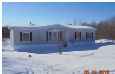
5150 Belcher Rd, Taberg