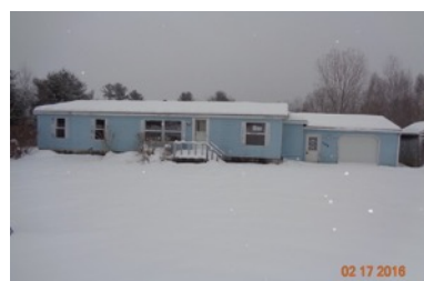
105 JCA Rd, Hastings