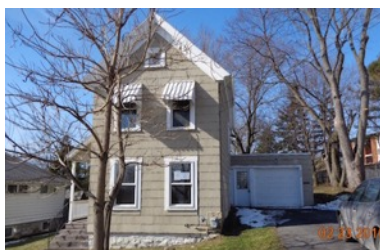
226 Erickson St, Syracuse