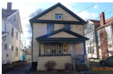
316 Cannon St, Syracuse