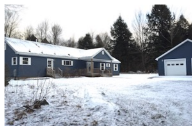
3382 McConnellsville Rd, Blossvale