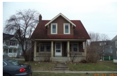
144 Hixson Ave, Syracuse