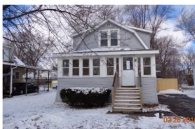
222 Garden City Drive, Mattydale